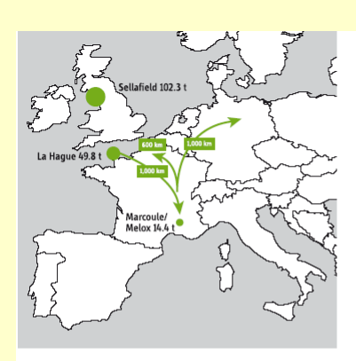
Figure 1.6. Sites and transport-routes of separated plutonium in Europe. Separated plutonium oxide is shipped regularly from the French reprocessing facilities for fuel-fabrication at Marcoule and from there to reactor sites in France, Germany, and

International Panel on Fissile Materials, Global fissile material report 2007.